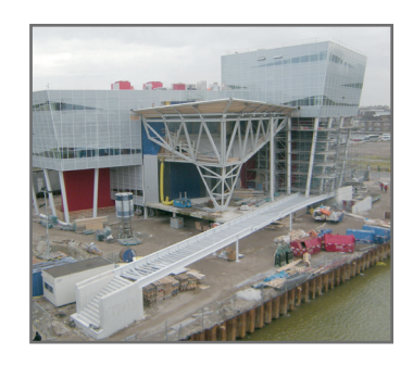
Time to produce models has been reduced from months to hours

\textbf{Stratasys} \mid \text{www.stratasys.com} \mid \text{info@stratasys.com}