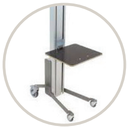
Trolley Easy build box transport