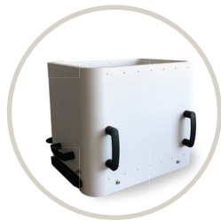
Stratasys H350 build removal box Simple, transportable add what you need