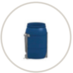
Stratasys H350 powder container Add what you need