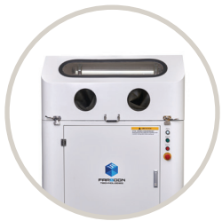
Powder retrieval station Solution for Stratasys H350 printer or your choice