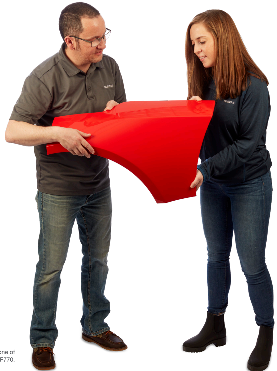
This painted 3D printed car fender illustrates just one of the many large-part applications served by the F770.

Instead, the F770 offers the opportunity to avoid that time and effort. It precludes having to stay with the slower, more expensive status quo of machining large prototypes and tooling fixtures or piecing parts together with smaller printers. Virtually any manufacturer that deals with larger tools and components can benefit from the F770's capabilities.